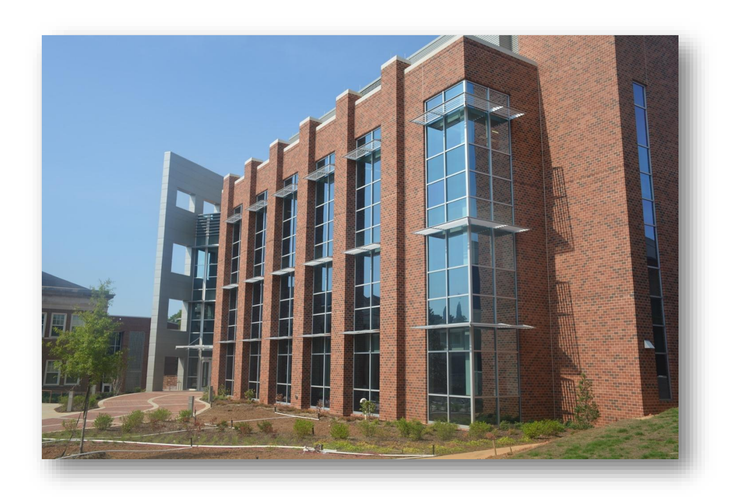
Johnson C. Smith University's new Science Hall opened in Fall 2015 and received a LEED-Silver status for its energy efficient design features.