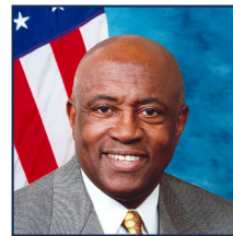
EDOLPHUS “ED” TOWNS

Men account for only 20 percent of social workers in the U.S. This virtual conversation