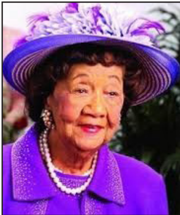
DR. DOROTHY I. HEIGHT SOCIAL WORK PIONEER

Dr. Height established the Center for Racial Justice and became one of the leading figures of the Civil Rights Movement and collaborated with Martin Luther King Jr., A. Philip Randolph, Roy Wilkins, Whitney Young, Jr., John Lewis, and James Farmer on different initiatives such as the March on Washington. Please show your support for Johnson C. Smith University's School of Social Work by making a gift to the Dorothy I. Height Scholarship fund today. All proceeds go to award scholarships to undergraduate and graduate social work students.